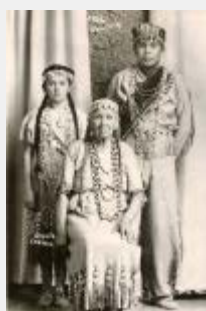
Three Native Kids