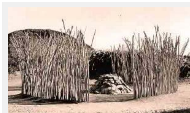
Shrine of Martyred Children

Information: This Program Instruction (PI) provides instruction on the availability of Federal fiscal year 2015 funds under the Community-Based Grants for the Prevention of Child Abuse and Neglect program created by Title II of CAPTA as amended by Public Law (P.L.) 111-320.