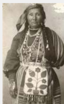
Indian Woman