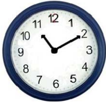
Table 1. Brief Tests to Detect the Cognitive Impairment of Dementia