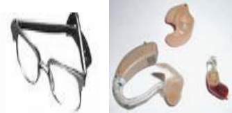
Maximize Hearing and Vision

An elderly inpatient can benefit from simple prevention techniques, listed on the reverse.