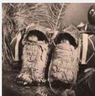
Sharlot Hall Museum Twins