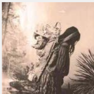
Sharlot Hall Museum Woman with papoose