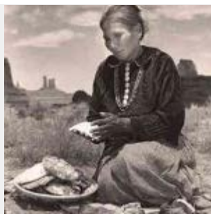
Sharlot Hall Museum Woman with basket