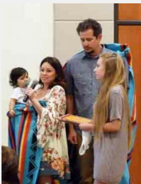
Tribal STAR Honored family