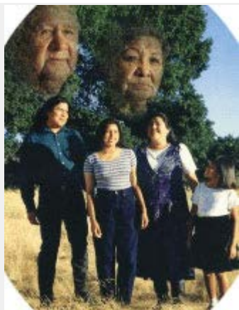
Native Family Contemporary