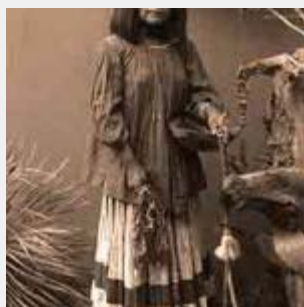
Sharlot Hall Museum Woman with water

The Calendar contains local events and conferences both local and national that will be of interest to those who work in or with the Tribal community.