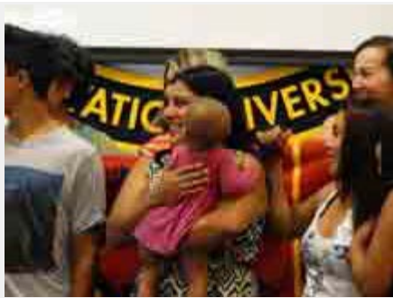
Tribal STAR Honored family