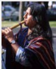
Native Man with flute

General information, pertinent articles and resources related to Native American Foster Youth can be sent to tstar@mail.sdsu.edu by December 1, 2015. The newsletter will be distributed during the last week of December. Please see the distribution schedule for other dates.