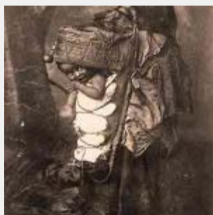
Woman with papoose

Approximately 800 Tribal and non-Tribal professionals, leaders, public Human Service agency staff, regional training academy staff and university students have received training throughout the project. The training package provides up-to-date, research-based information in a variety of areas, including: the youth development philosophy, methods for collaboration, effective ways to work with rural populations, effective ways to work with Tribal rural foster youth and their communities, the Indian Child Welfare Act, and the John H. Chafee Foster Care Independence Act.