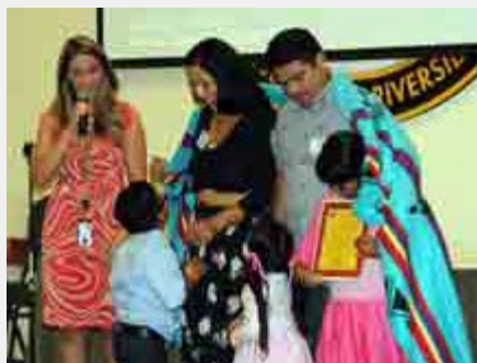
Tribal STAR Honored family