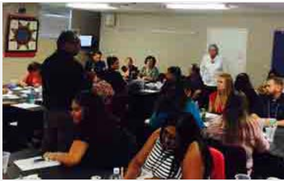
NIJC Training 2015