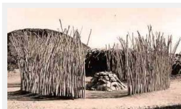
Shrine of Martyred Children