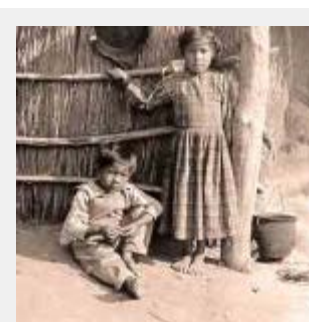
Local Indian Kids

http://www.sapphyr.net/natam/quotes-nativeamerican.htm