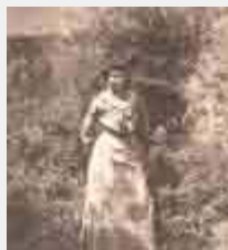
Young Indian Woman